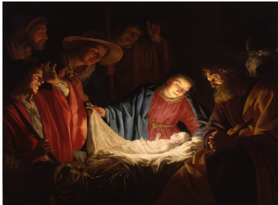
Gerard Van Honthorst - Adoration of the Shepherds 1622

Silent night, Holy night Son of God, love's pure light Radiant beams from Thy holy face With the dawn of redeeming grace Jesus, Lord at thy birth Jesus, Lord at thy birth