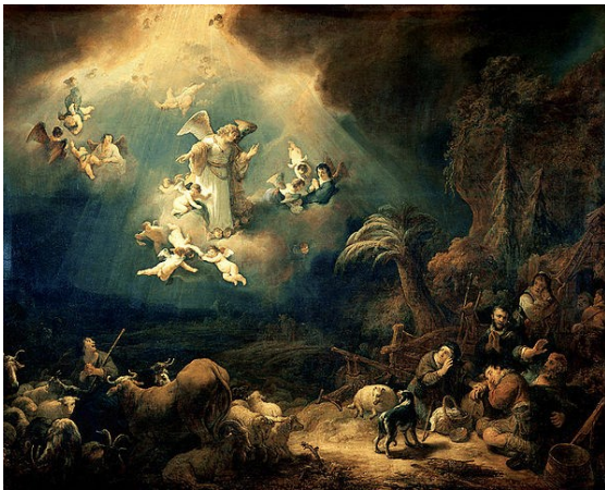
Govert Flinck - Angels Announcing Christ's Birth 1639

Prophets foretold Him Infant of wonder Angels behold Him on His throne Worthy our Saviour of all their praises Happy for ever are His own